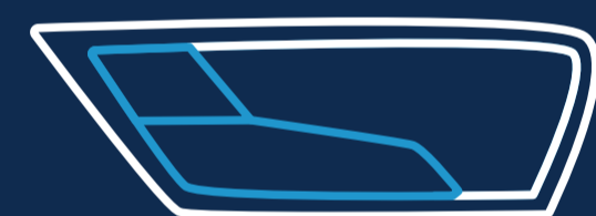
INSIDE DOOR HANDLE

WE ALSO RECOMMEND CLEANING: CENTER CONSOLE, ARMRESTS, TOUCHSCREEN, AUDIO CONTROLS, START/STOP BUTTON, WINDOW/SEAT/MIRROR CONTROLS AND REARVIEW MIRROR.